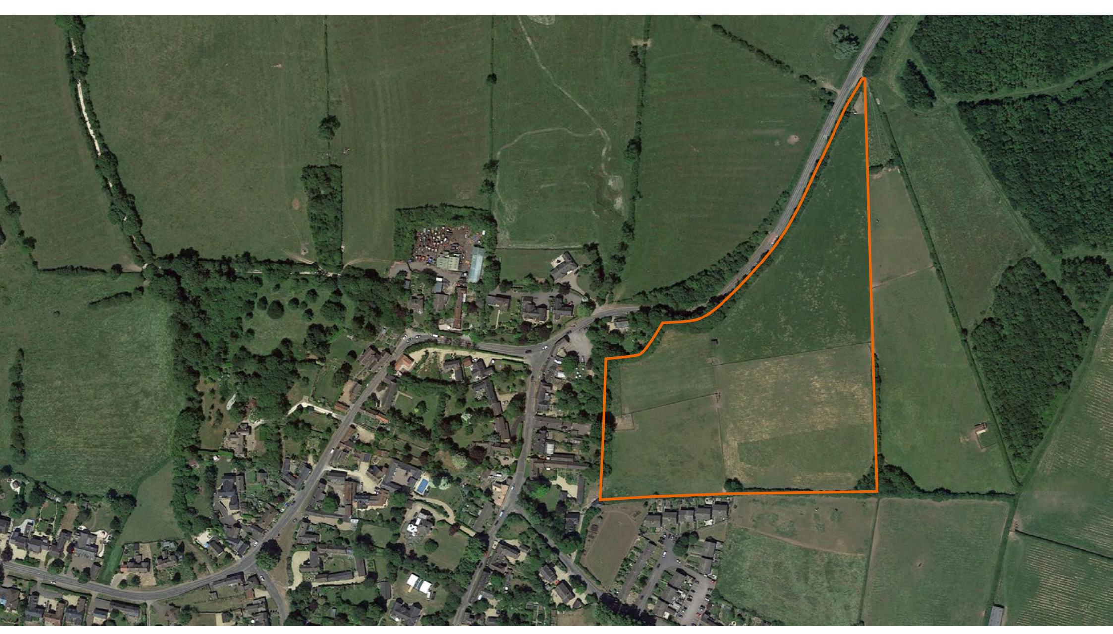
Land to the South East of Oakham Road, Braunston, Rutland